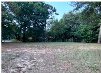
UNDER CONSTRUCTION 4651 Kingston Drive (2 lots)