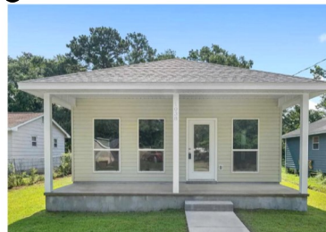
FOR SALE 1038 Bremen Avenue

700 South Palafox Street, Suite 310 Pensacola, FL 32502