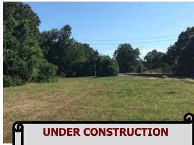
UNDER CONSTRUCTION 100 Blk East Jordan Street