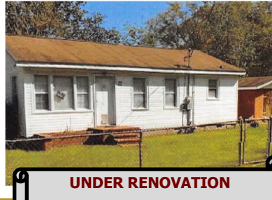
UNDER RENOVATION 200 Rocky Avenue