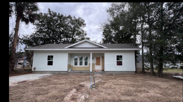
FOR SALE 707 East Scott Street

Escambia County Housing Finance Authority